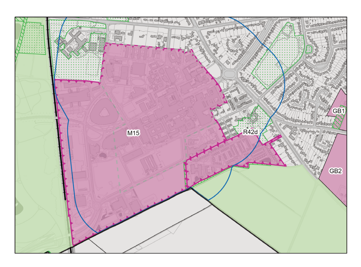
Map 1: Map of Cambridge Local Plan site allocation M15