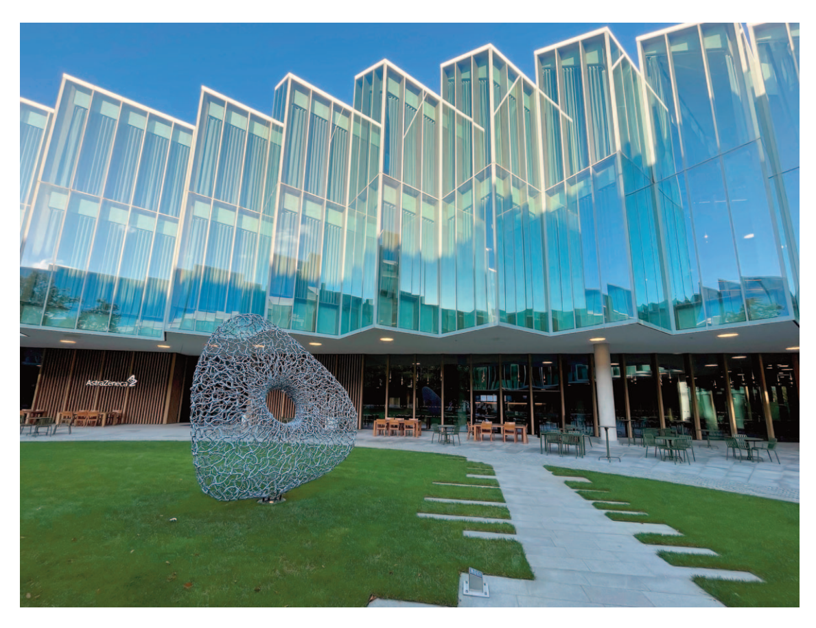
Image 3: Publicly accessible courtyard of the AstraZeneca building